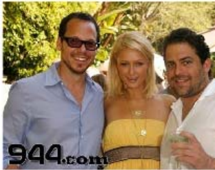
More images from the event

Jurlique Biodynamic BBQ At Brett Ratner's Home